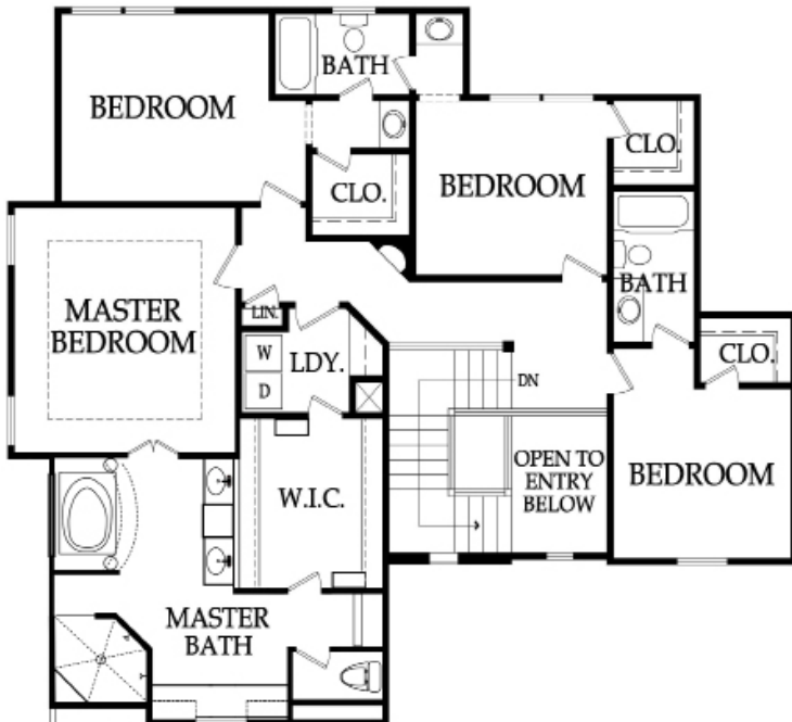
UPPER LEVEL: 1,470 SQ. FT.

TWO-STORY • 5 BDRM • 2,730 SQ. FT. • 4 BATH • 3 CAR GARAGE